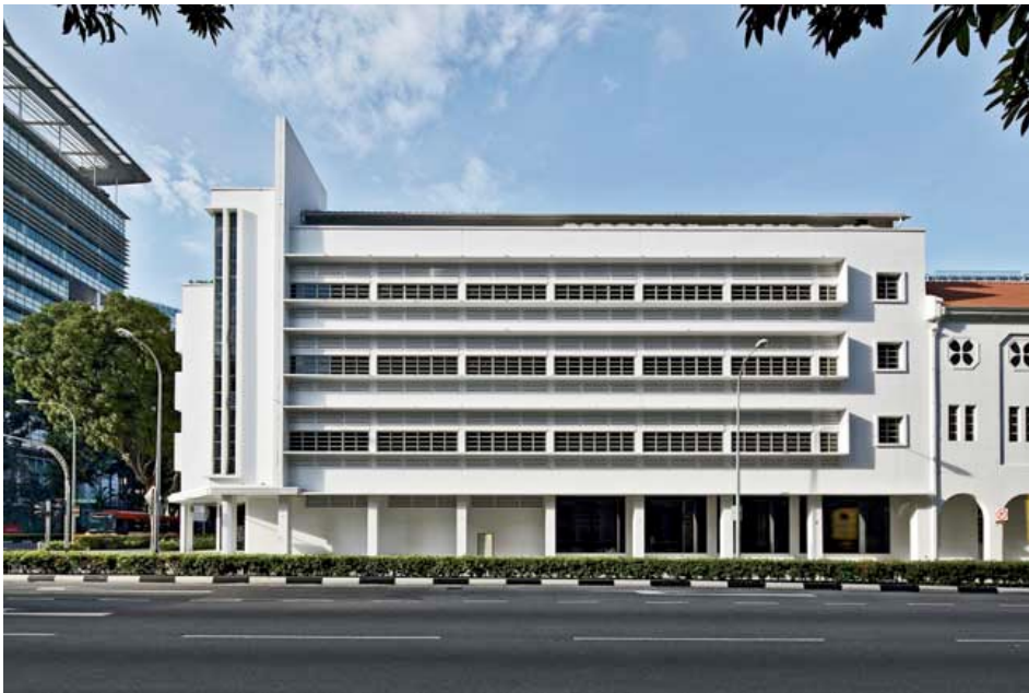
The newest of the four buildings comprising the NDC occupies the east end of the site and dates from the 1940s.

Religious conversion: Once a Catholic school, a set of buildings from different decades of the 20th century has been transformed into a modern design hub.