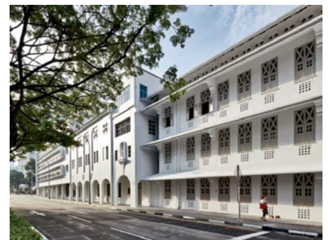
Three of the four buildings comprising the 85,000-square-foot NDC face Middle Road with the oldest on the right and the newest on the far left.

While mostly restoring the exteriors of the four buildings that make up the former Saint Anthony Convent school, Chan added and subtracted key spaces on the inside. The buildings—three of which date from the 1920s and '30s and the fourth from the '40s—represent a range of styles from British Colonial to Moderne. They sit in the Bras Basah/ Bugis part of town, a few blocks from the historic Raffles Hotel and across the street from Ken Yeang's National Library. Three of the structures line up along busy Middle Road and are connected inside, while the fourth sits behind them on quieter Queen Street, separated by just a driveway. The NDC serves as the home of the DesignSingapore Council, the national