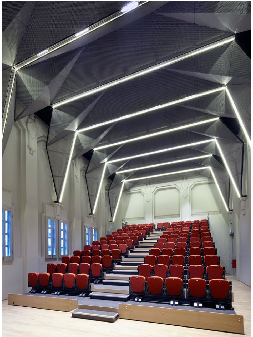
SCDA balanced heavy and light materials throughout the project, for example adding a folded metal-mesh ceiling to the muscular space that had once been the school's chapel and now serves as the auditorium.

Changes to the exteriors were subtle but important. The architects replaced old tiles with new ones on some roofs, repaired crumbling plaster, and installed new low-E glass in windows. To better connect the inside to pedestrian activity on Middle Road, they added a few new windows on the ground floor. A big challenge was designing a new entrance for the complex without disturbing the 5-foot-wide colonnade wrapping around its street-side facades. In the end, they chamfered one corner and inserted an angled Cor-ten wall announcing the NDC. It's a simple but dramatic move that exemplifies Chan's approach to design.